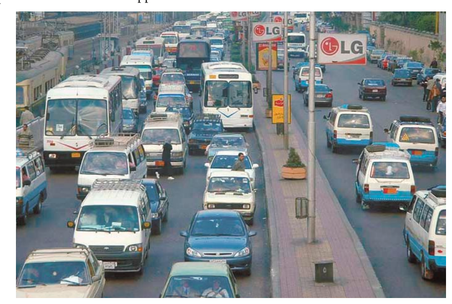
A congested road in Cairo, and the terminus of Cairo's last remaining tram line. Transport problems in developing cities tend to get worse rather than better with economic development. Karl Fjellstrom, Mar. 2002

At the core of the new model is a severe restriction of automobile use, with total restriction of cars and commercial vehicles during 5 or 6 peak hours every day. During those 2.5 or 3 hours every morning and afternoon, all citizens will move exclusively using public transport, bicycles, or walking. It sounds simplistic, but the environmental implications in terms of noise, air pollution, energy consumption, and land use are significant. Socially, it would free immense resources currently devoted to care for roads mainly for the upper income citizens that could be used to invest in the needs of the poor; it would get all citizens together as equals regardless of income or social standing in public spaces, public transport or bicycles. And most importantly, it would allow cities to become a place primarily for people, a change from the last 80 years a time during which cities were built much more for motor vehicles' mobility than for children's happiness.