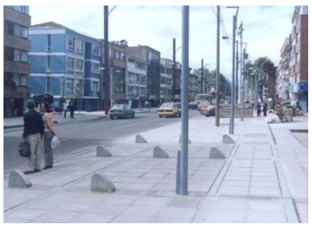
Fig. 3 "Before" and "after": parking and public space improvements in Bogotá.

Enrique Penalosa 2001, presentation to the Surabaya City Council