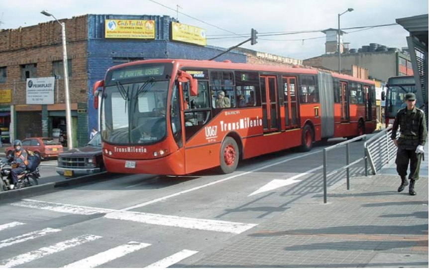
Fig. 11 TransMilenio's bus fleet is operated by 10 profitable private operators under contract to the stateowned but autonomous and professional regulator, TransMilenio S.A.Karl Fjellstrom, Feb. 2002

TransMilenio uses articulated, 165-passenger buses with clean diesel engines that comply with Euro II emission standards. Contractual arrangements guarantee that buses are extremely clean, well-lighted, and are changed before they are in less than perfect shape. Drivers wear uniforms and are required to attend approved training programs. While some