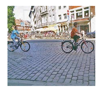
Muenster, Germany Aug. 2001

Today's children in developing cities face a very different reality. Their ability to travel, explore and play outside the home is severely restricted by hostile traffic conditions. The street is now a dangerous environment for them. Dense traffic, lack of pedestrian and cycling facilities, air pollution and noise make getting around not only difficult for children, but extremely dangerous for every one.