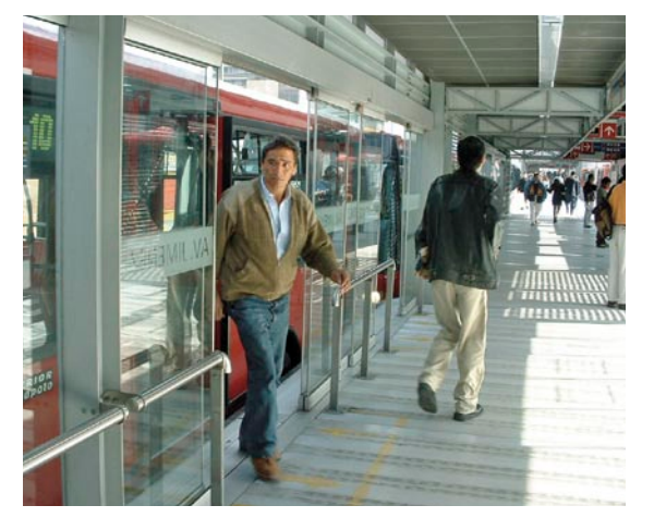
Fig. 12 TransMilenio has the look and feel of a rail system, but with the operational costs and other advantages of buses. Bus stations and bus doors are elevated. allowing quick boarding and alighting.

buses stop at all stations, others operate express routes stopping at only a few. Passengers can change from a local to an express bus with the same ticket; as they can also change from a bus on one route to another on a different route at no extra cost. Feeder buses sharing streets with the rest of traffic give people in marginal neighbourhoods access to the system. Trans-Milenio buses run in the middle of avenues and not on the sides, so that vehicles entering and exiting driveways, or delivery vehicles, do not become obstacles. Also, in this way one station is required in each place, instead of one in each direction. Although TransMilenio is the fastest means today to move about Bogotá, it could be made even faster by building underpasses for the buses at busy intersections. This can easily be done at any time in the future. There is nothing technically complex about TransMilenio. The issue is whether a city is ready to get cars off several lanes in its main arteries, in order to assign them exclusively to articulated buses. If