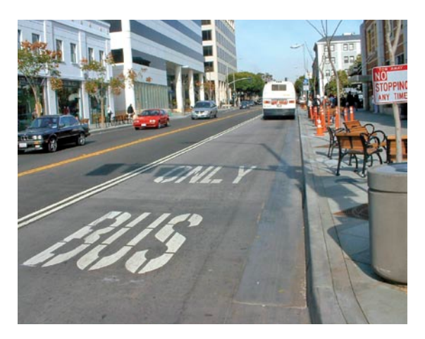
Fig. 6 The Los Angeles county of Santa Monica is implementing pedestrian, cycling, and bus improvements, including replacing car with bicycle parking (above).