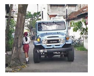
Surabaya, Indonesia Jan. 2000

Adults in developing cities can fondly recall when they used to walk or ride bicycles to school. They could play in the street and feel quite safe.