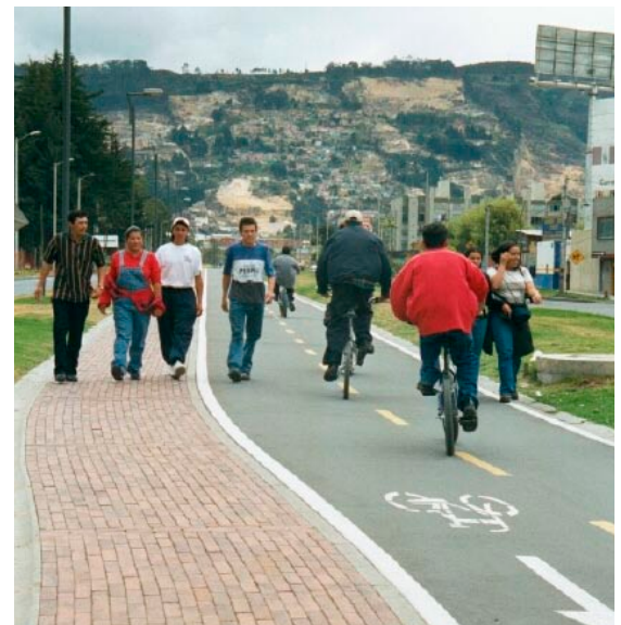
Fig. 4 Themes of cultural emptiness in a caroriented US-style city (above) contrast with the cultural richness of a pedestrian and cyclistoriented setting (left and below).

Los Angeles, Jan. 2002 (above); Suzhou, China, Jan. 2002 (below) ; Bogotá, Colombia (left)