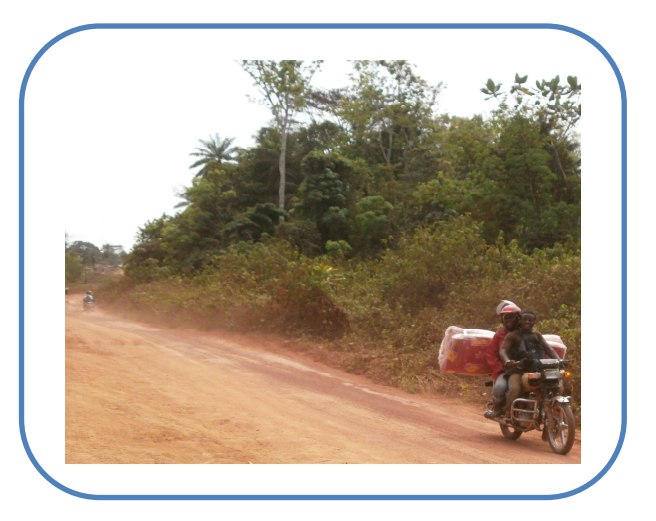
A heavy-loaded Phen-Phen on a rual road.

people often prefer driving a Phen-Phen rather than working in a proper job.