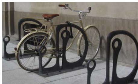
Individually designed, short-term bicycle parking in Wroclaw, Poland

Many location and design aspects are applicable to both short and long-term parking. Parking needs to be well lit, at street level or accessible via ramps (no stairs or other barriers) and easily visible. Signs alerting users to a facility’s location may be necessary. Facilities must be stable and support the bicycle frame, not just part of a wheel, and allow the frame and a wheel to be locked with one lock. They should be close to origins and destinations and fit aesthetically into the surrounding built environment.