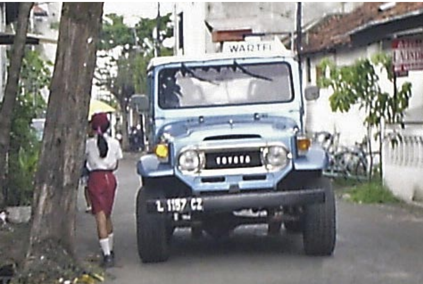
Fig. 1 Traditional transport planning in developing cities prioritises car travel (and hence drivers) over all other transport modes (and people). Karl Fjellstrom, 2000 (Surabaya)

To understand why such large benefits are possible it is useful to consider some basic market principles. Efficient markets have certain requirements, including consumer choice, competition, cost-based pricing, and economic neutrality in public policies. Most markets generally reflect these principles: consumers pay directly for housing, food and clothing. But transportation markets tend to violate these principles: consumers often have few viable options, many costs are external or fixed, and government policies often favour one mode over others. Mobility Management strategies can help correct these market distortions, creating a more efficient and equitable transportation system, as described in Table 4.