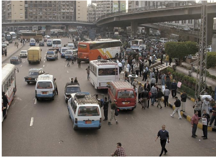
Module 3d: Preserving and Expanding the Role of Non-motorised Transport.

Non-motorised transport (also known as active transport and human powered transport ) includes walking, cycling, hand carts and animal carts. Non-motorised travel is critical for a diverse transport system. Non-motorised modes are important in their own right, and most transit trips include walking links - non-motorised transport improvements are often one of the most effective ways of encouraging transit use (Figure 5). The quality of the pedestrian environment is important for community livability and social cohesion. Making streets pleasant and safe for walking allows residents to interact and children to play. There are many specific ways to improve non-motorised transportation, as discussed in the