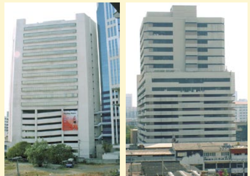
Karl Fjellstrom, Dec. 2001

Bangkok also applies a policy stipulating minimum parking facilities in new buildings. This results in up to 10 or more floors of many buildings devoted to parking (picture below). Predictable congestion results, for example, when 200 residents of a medium apartment block – all provided with parking spaces – try to drive to work in the morning via the narrow access roads. Despite the excessive devotion of space to parking, however, parking is often lacking where it would be most useful: close to outer stations of the Bangkok Skytrain MRT line.